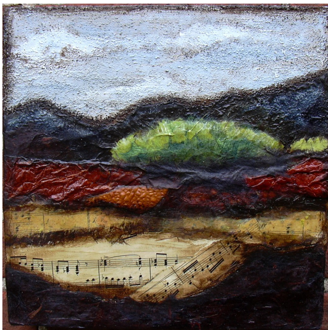
DARK HILLS-- PAPER LANDSCAPE, Contemporary collage painting, mixed media, 10X10