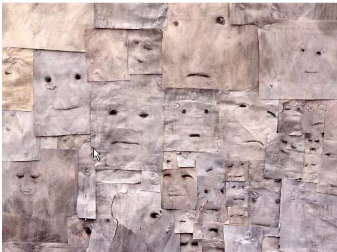
Matt Bryans, Untitled , 2004, erased newspaper, dimensions variable.